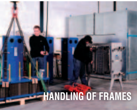
HANDLING OF FRAMES