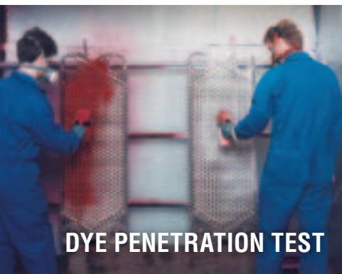
DYE PENETRATION TEST